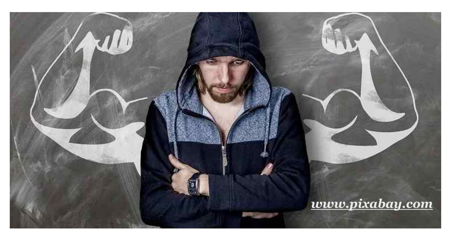
WE ARE CONSIGNED TO HOPE BY