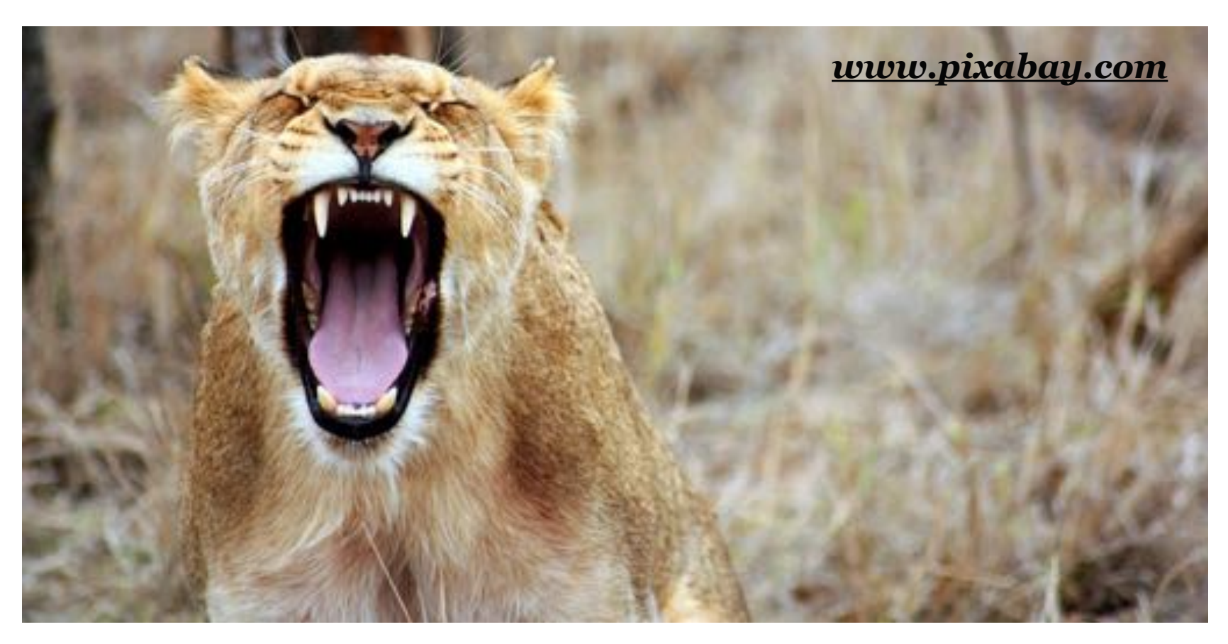
WHEN YOU DEMAND YOUR WAY you have discounted God's way.

The last thing any one of us wants to discover is that we cannot have our way, OUR FREEDOM! So we POUT. Not always 'out loud' but we POUT none the less. In fact, in the 'free world' we deem freedom as a God given gift, one that must be defended at everyone's expense. That defiance is the child of Mr. POUT.