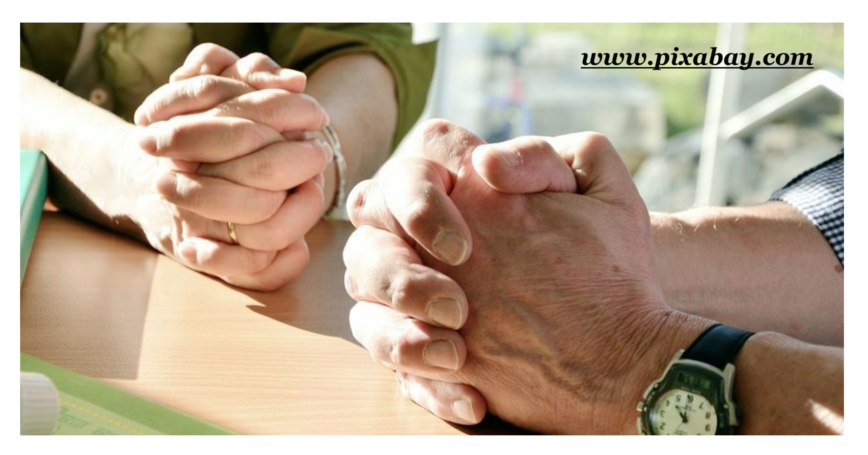
TRUST IS NOT ALWAYS HARD...